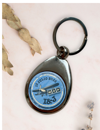
WOP Keychain or personalized keychain